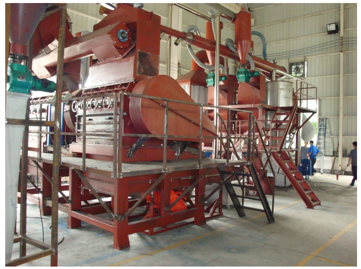
LOOK AT THIS SYSTEM THAT MAKES A FINE CRUM...

IT'S A LOT MORE COMPLICATED THAN A RASPER SYSTEM