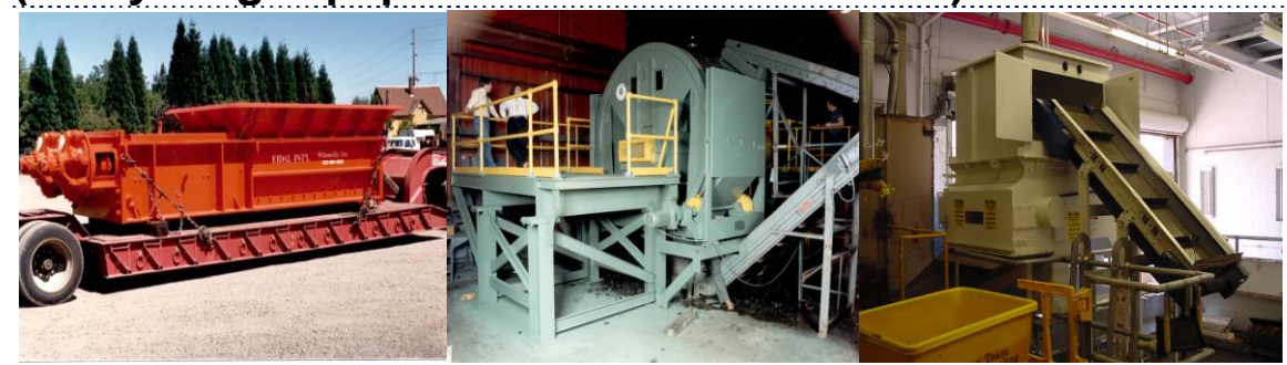
Global Recycling Systems, with the City of Stamford CT, the City of Louisville KY, Bristol Myers Squibb, GM, Boeing and 8000 other satisfied users worldwide.....

Global Development International Inc.( Oregon ) Shredderhotline.com Company Inc. Division ( Illinois ) ( Recycling Equipment Division of Global )