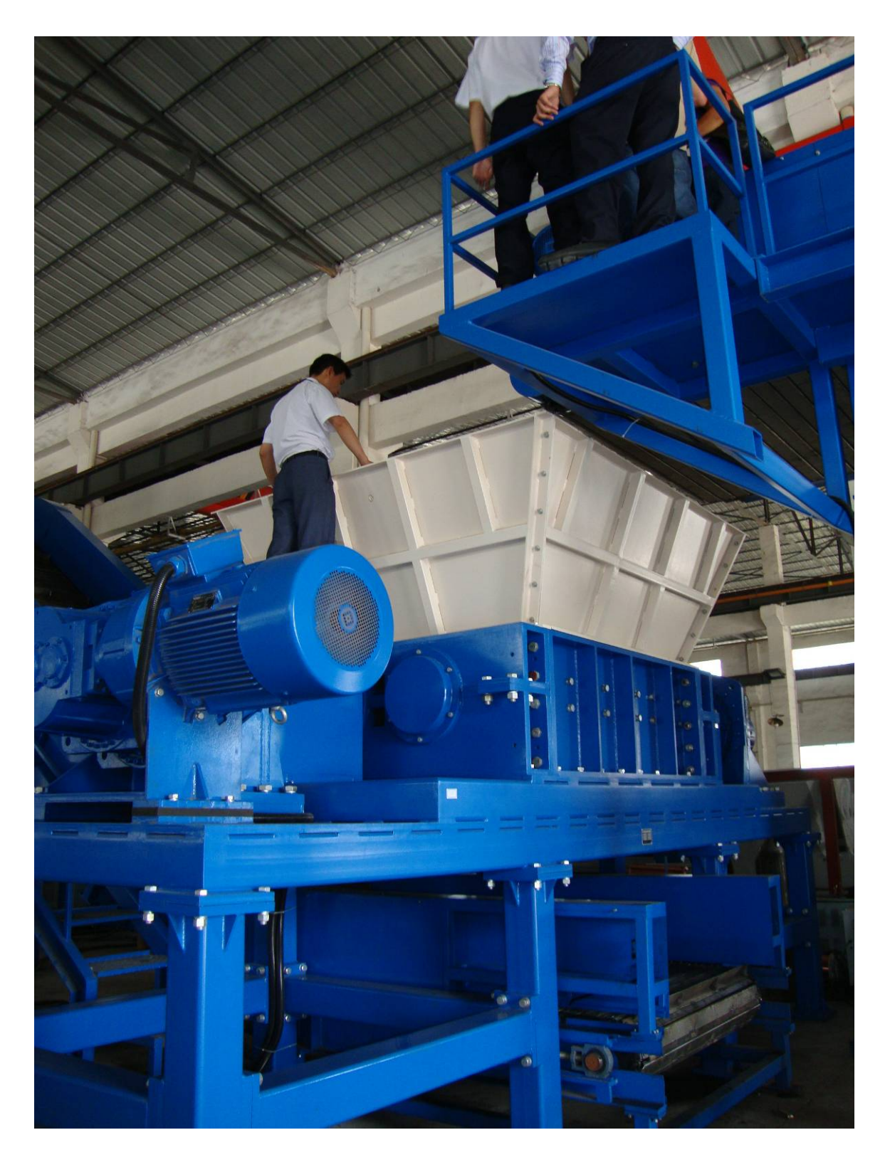
THIS PICTURE ABOVE IS THE SHREDDERHOTLINE.COM EIDAL 7272 UNIT, WITH A 24" SHAFT CENTER DESIGN