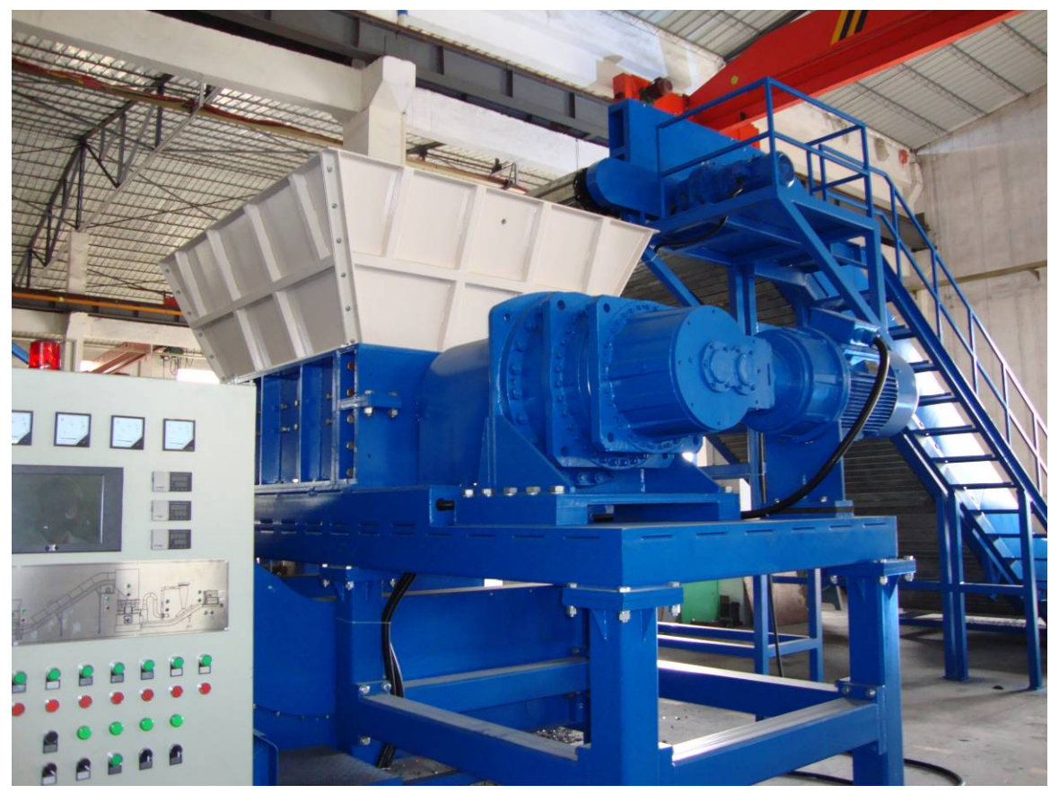
THE PICTURE ABOVE IS OF A SINGLE SHREDDER ROUGH SHRED SYSTEM...