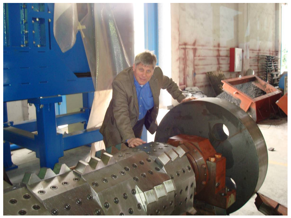
THIS IS THE INTERNAL ROTOR OF A RASPER TYPE MACHINE...