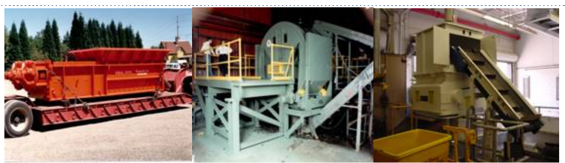
Global Recycling Systems, with the City of Stamford CT, the City of Louisville KY, Bristol Myers Squibb, GM, Boeing and 8000 other satisfied users worldwide.....

PROFORMA INVOICE, QUOTATION AND SPECIFICATION DATA FOR A MILD STEEL MODEL 3434 DUAL SHAFT SHEAR SHREDDER WITH A 40 HP DUAL (TWO 20 HP) DRIVE MOTORS FOR USE IN VARIOUS SHREDDING APPLICATIONS INCLUSING PASSENGER TIRE SHREDDING FOR 2" CHIP PRODUCTION FROM GLOBAL DEVELOPMENT INTL AND SHREDDERHOTLINE.COM COMPANY INC.