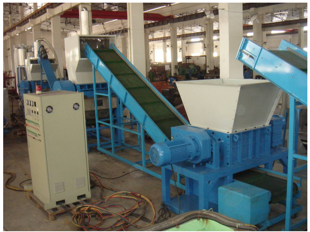
This is a typical linear tire system to make a small granule.

The main quotation is for a mild steel 3434 shredder with a ram type hopper for steel and plastic drum shredding. However, we have included data on the Recirc System drawing outlined above as it has applications for tire recycling when one machine is used to make a fuel chip or to make an aggregate substitute chip.