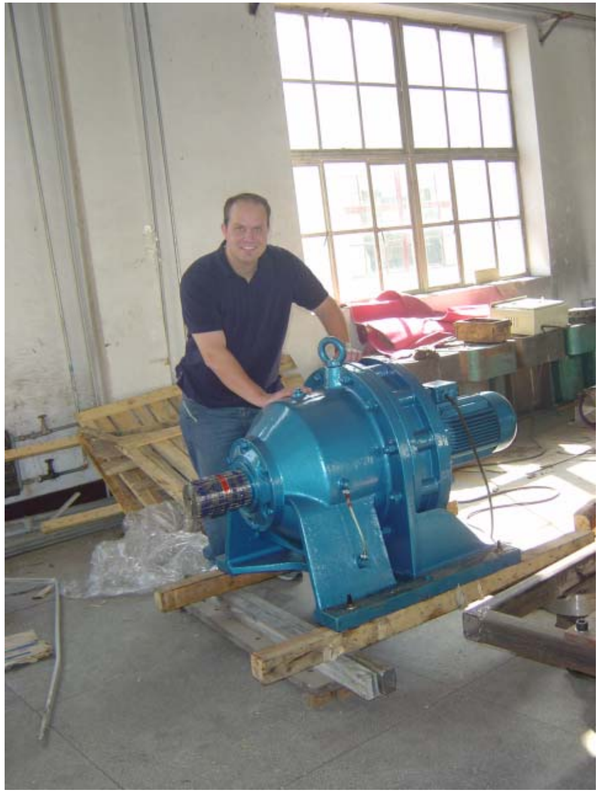
This is one of the two High Ratio Gearboxes that allows us to operate the unit with as low of Hp as 10 HP for many applications.