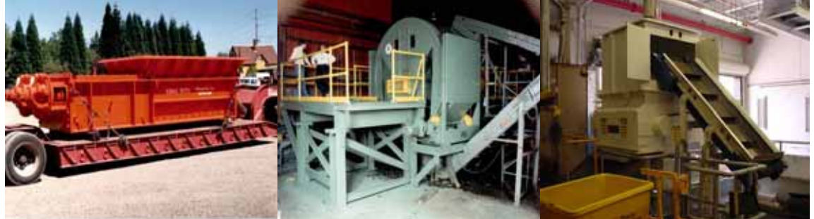
Global Recycling Systems, with the City of Stamford CT, the City of Louisville KY, Bristol Myers Squibb, GM, Boeing and 8000 other satisfied users worldwide.....

Global Development International Inc.( Oregon ) Shredderhotline.com Company Inc. Division ( Illinois ) ( Recycling Equipment Division of Global )