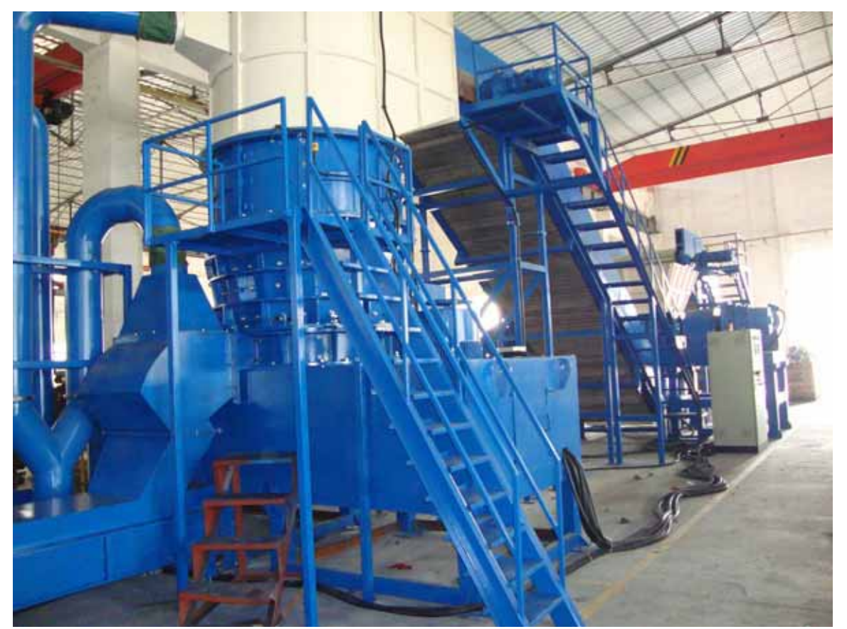
THIS IS AN ELECTRONIC SCRAP METAL PROCESSING LINE, OR A WHITE GOOD PROCESSING LINE, OR A CAR PART METAL PROCESSING LINE...MULTI FUNCTION SYSTEM FOR MANY APPLICATIONS...