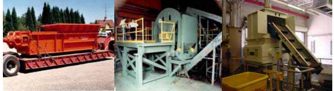
Global Recycling Systems, with the City of Stamford CT, the City of Louisville KY, Bristol Myers Squibb, GM, Boeing and 8000 other satisfied users worldwide.....

GLOBAL RECYCLING EQUIPMENT Shredderhotline.com Company Inc. (Illinois) Global Development International Inc. (Oregon) Chicago USA, Montreal Canada, Guangzhou China