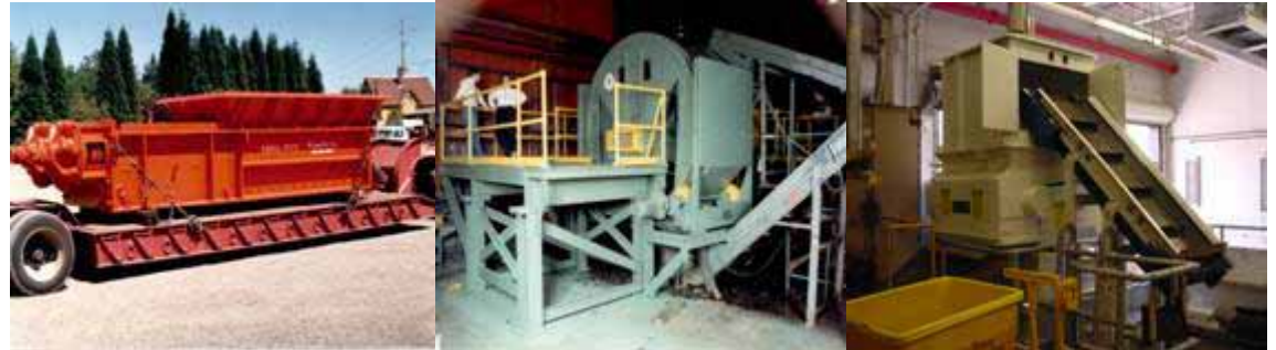
Global Recycling Systems, with the City of Stamford CT, the City of Louisville KY, Bristol Myers Squibb, GM, Boeing and 8000 other satisfied users worldwide.....

Shredderhotline.com Company Inc. P.O. Box 399 707 North Park Street Streator, Illinois 61364 U.S.A. www.shredderhotline.com