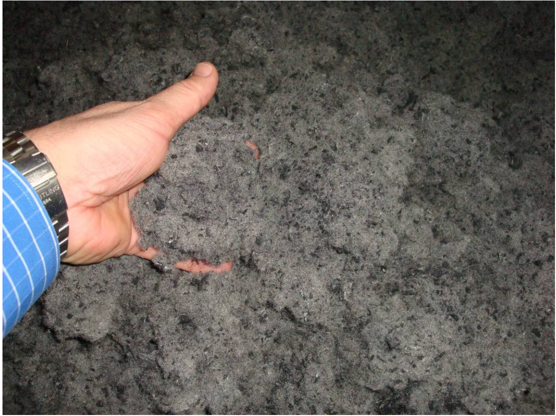
FIRST STAGE FLUFF REMOVAL FROM PRIMARY AIR SYSTEM