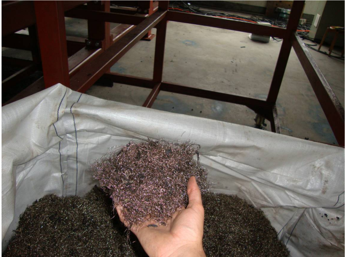
FIRST STAGE VIEW OF WIRE REMOVED FROM TIRE CHIP PRIOR TO SECONDARY CLEANING OF WIRE BEFORE BALING