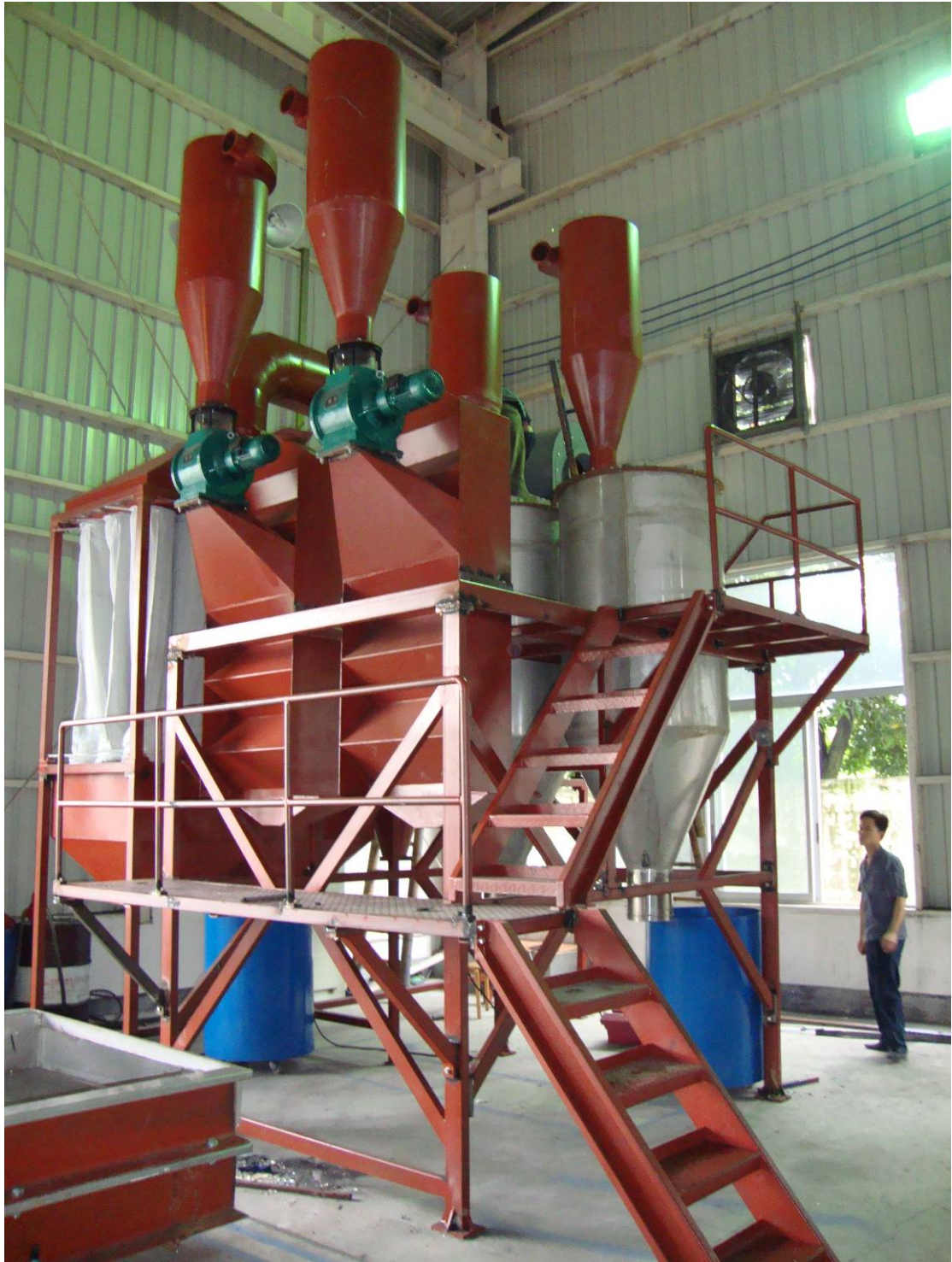
SETUP VIEW OF AIR COLLECTION SYSTEM