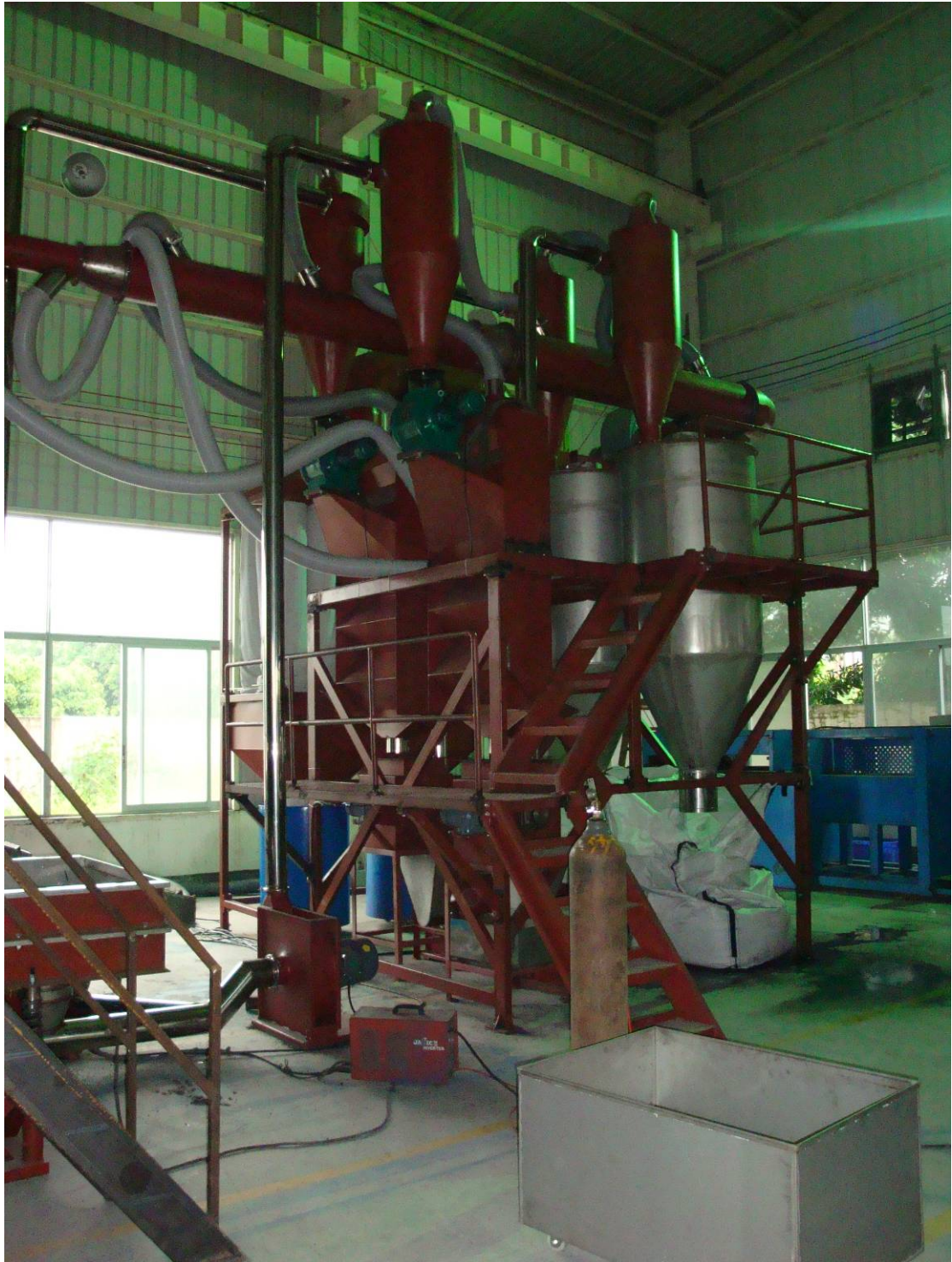
FINISHED VIEW OF THE FIBER REMOVAL SYSTEM AND FINE MAGNETIC REMOVAL SYSTEM AND CYCLONE SYSTEM AND GRAVITY SEPARATION