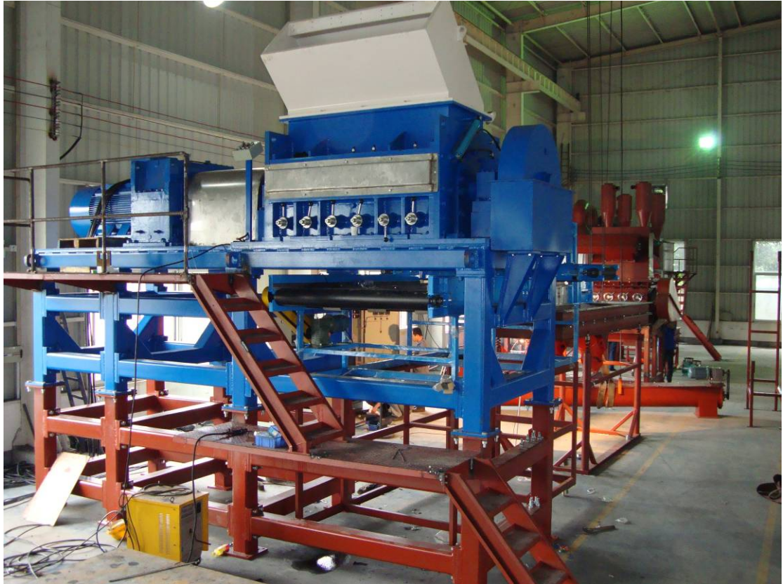
SETUP OF PRIMARY RASPER IN SYSTEM PRIOR TO ACCEPTANCE TESTING AT CLIENT FACILITY