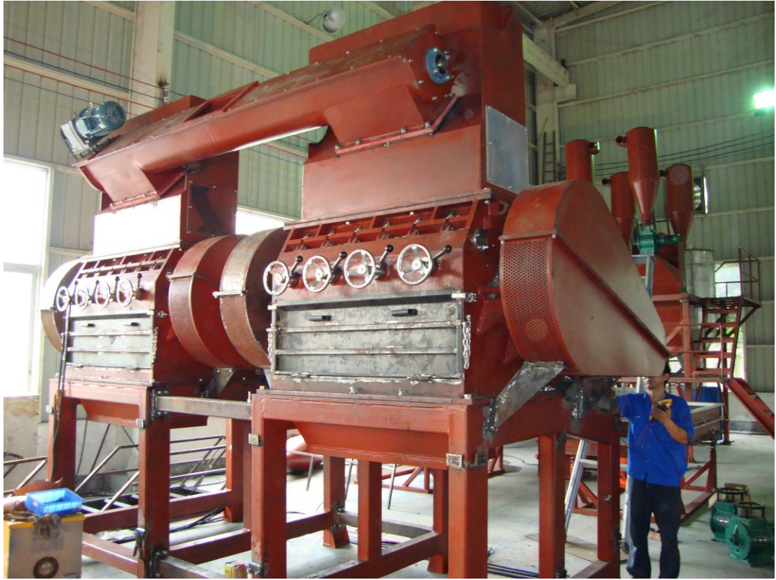
SETUP VIEW OF SECONDARY RASPER GRINDERS IN SYSTEM