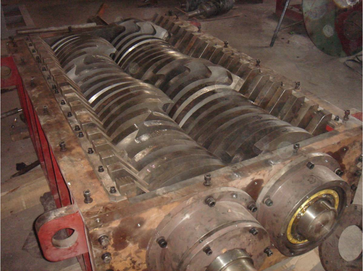
This is a picture of a non split end plate design 5444 cutter assembly with a 2" wide cutter stacked 1 X 1 for a 2" wide cut. Not the size of the opening which is 54" long and 44" wide.