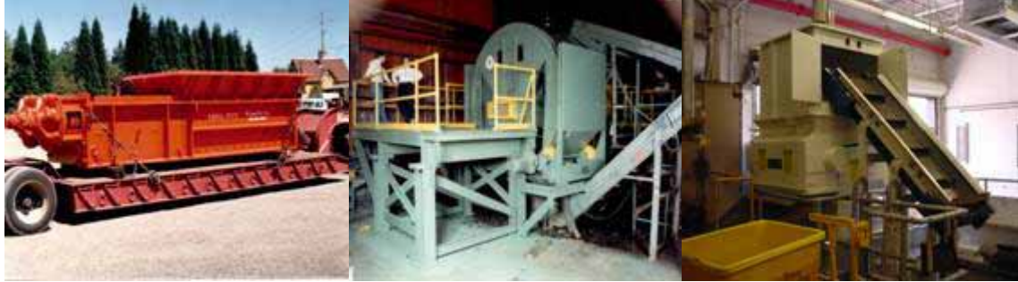
Global Recycling Systems, with the City of Stamford CT, the City of Louisville KY, Bristol Myers Squibb, GM, Boeing and 8000 other satisfied users worldwide.....

Shredderhotline.com Company Inc. P.O. Box 399 707 North Park Street Streator, Illinois 61364 U.S.A. www.shredderhotline.com