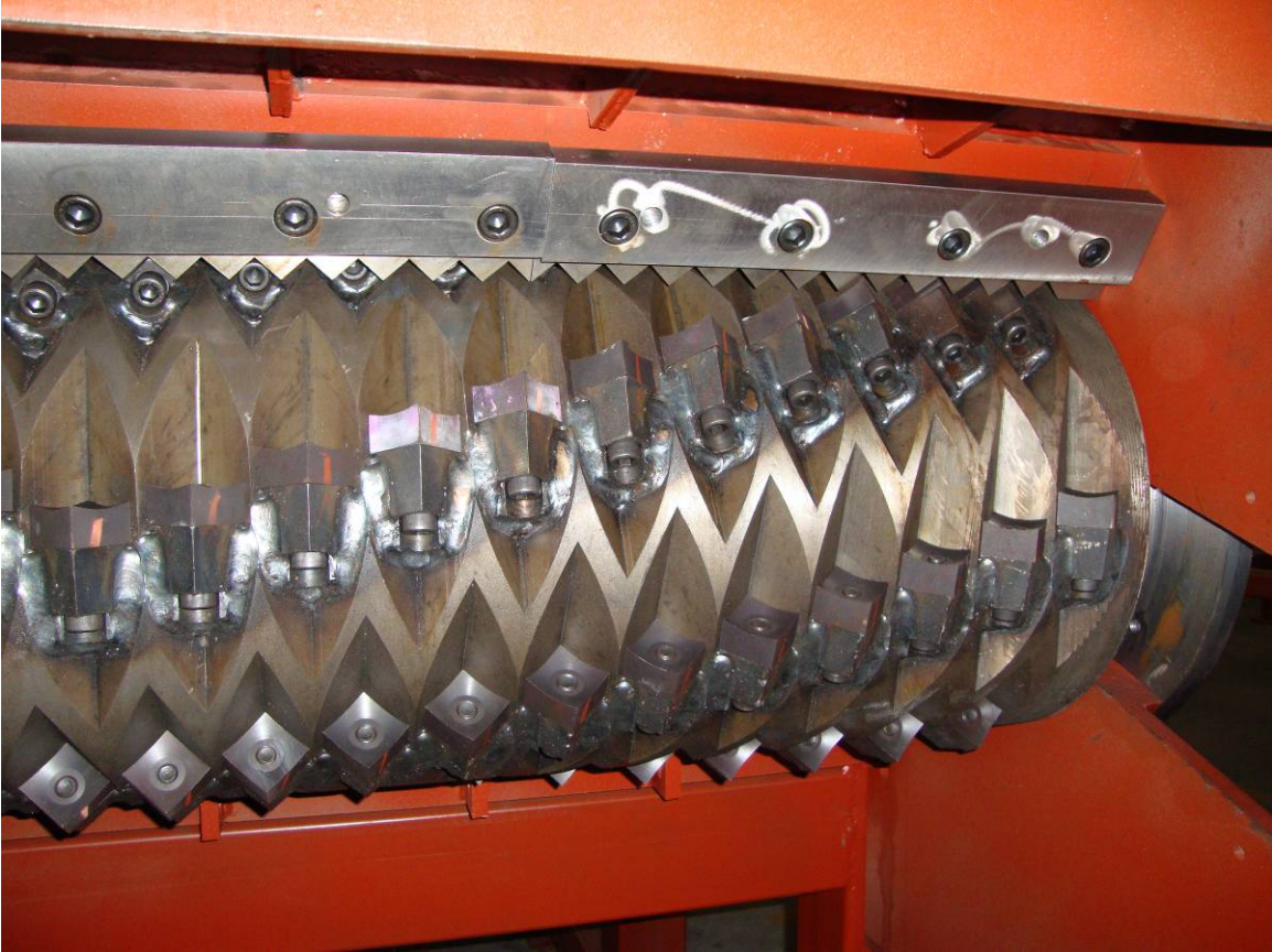
This is the rotor on our 6060 Series Unit, unit is not painted and is for sales purposes only. The unit is shown not completed.