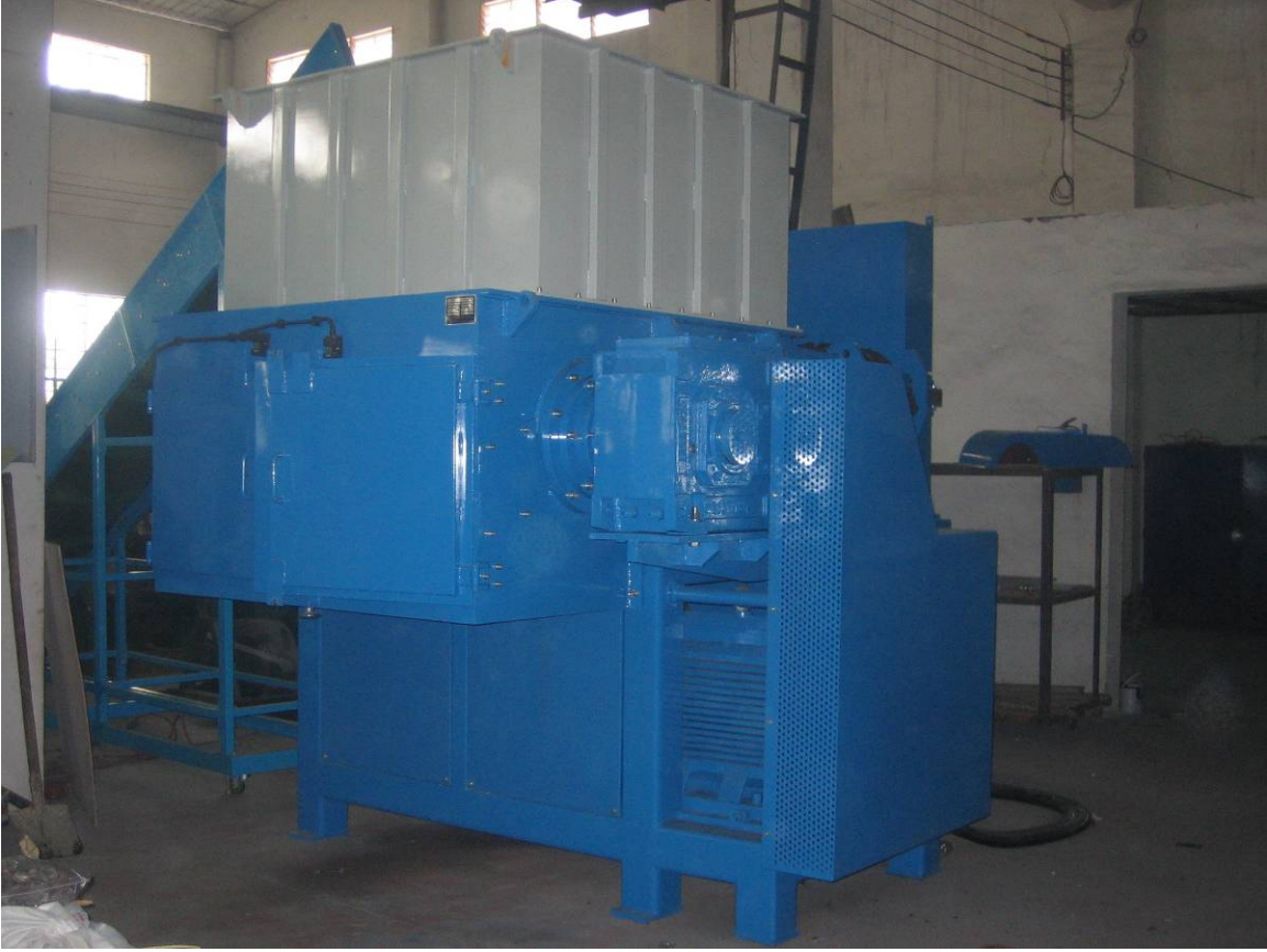
This is a 6060S Series Unit from another angle.